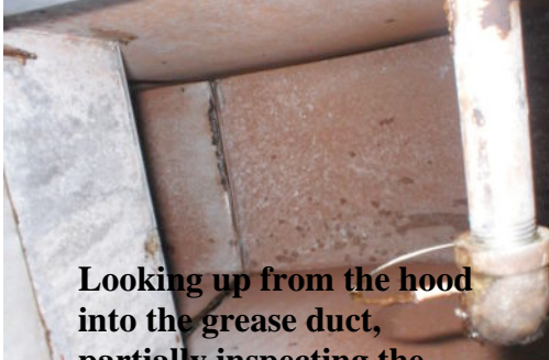
partially inspecting the horizontal plenum area

Looking into a horizontal above A hood drop-(notice the additional ductwork beyond the curve).